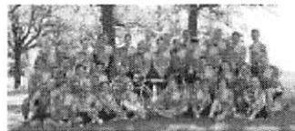
Our 2004 Fast Old Guys Club Photo (click on picture to enlarge)